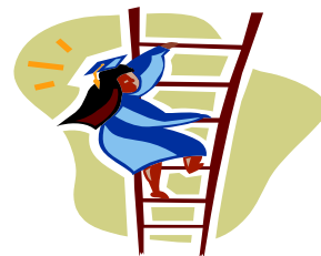
Young and Old can still climb the ladder of success

We now carry TENS units for pain control and relief. The TENS supplier company will bill your insurance company if you qualify and there will be no cost to you.